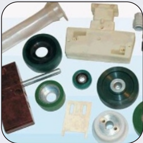
Plastic Textile Components