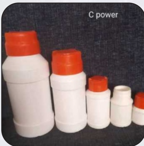
Pesticides Bottles For C Power