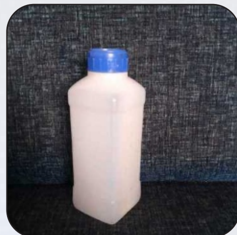
Square Bottle For Pesticides Industries