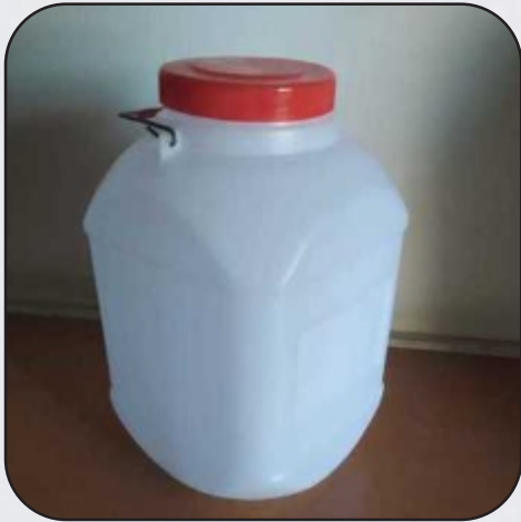
Plastic Jar - Up to 5 KG