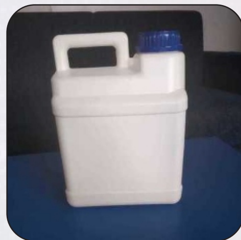
Rectangular Jerry Can