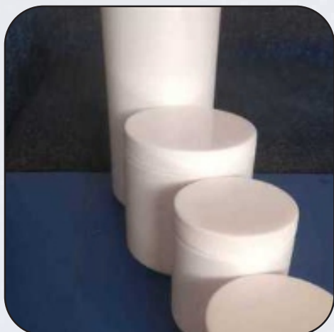
Plastic Bottle C Bond