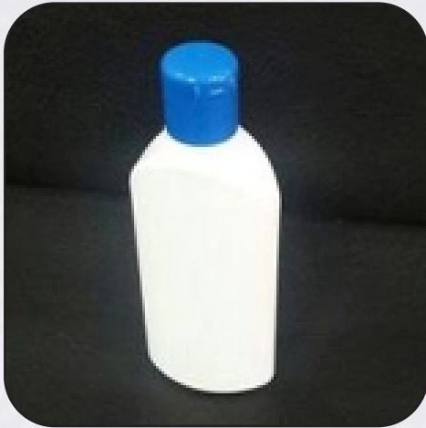
Bottle For Cosmetics Industries