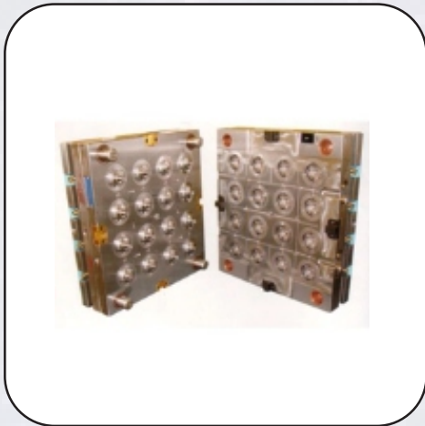
Plastic Mould & Die