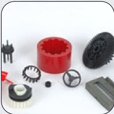
Plastic Machinery Parts