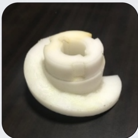
Delrin Gear ( Machined Plastic Part )