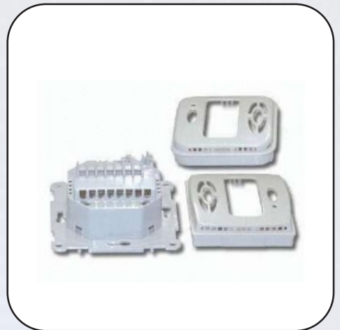
Plastic Electrical Parts