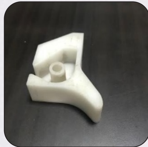
Delrin Bracket ( Plastic Machinery Parts )