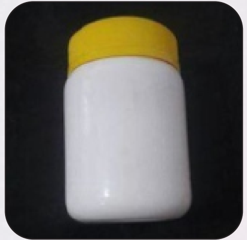
Bottle For Chemical Industries